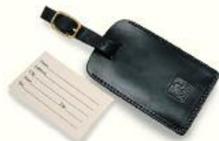
Briefcase Tag LG 1207 Black Cordovan LG 1208 Color 8 Cordovan