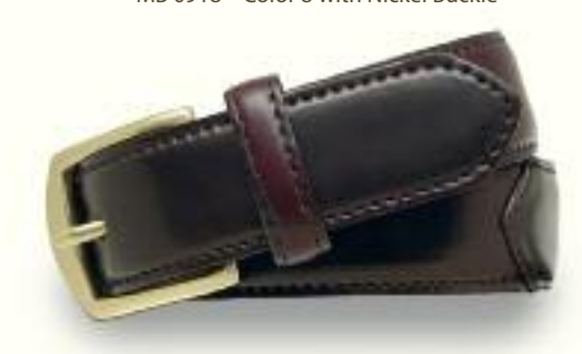
1.5" Cordovan Dress Belt MB 5908 Color 8 with Gold Buckle MB 5918 Color 8 with Nickel Buckle