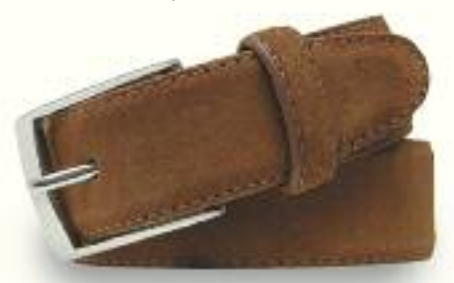
30mm Alpine Grain Calfskin Belt MB 0351 Dark Brown with Nickel Buckle

35mm Suede Dress Belt MB 5213 Tan Suede with Nickel Buckle MB 5214 Snuff Suede with Nickel Buckle MB 5215 Brown Suede with Nickel Buckle MB 5216 Navy Suede with Nickel Buckle