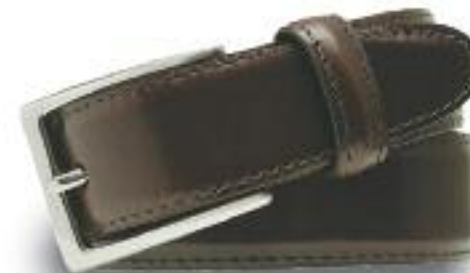
30mm Calfskin Dress Belt MB 0111 Black with Nickel Buckle MB 0112 Burgundy with Nickel Buckle MB 0113 Tan with Nickel Buckle MB 0115 Dk. Brown with Nickel Buckle

B 9 1/2-12, 13 D 6-12, 13, 14 E 6-12, 13 EEE 8-12, 13