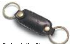
Rectangle Key Ring LG 2107 Black Cordovan ▶ LG 2108 Color 8 Cordovan