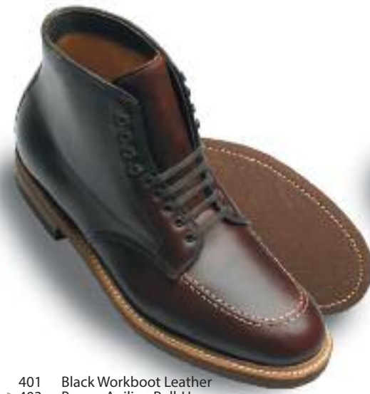
► 401 Black Workboot Leather 403 Brown Aniline Pull-Up