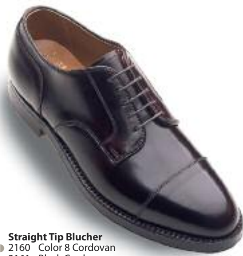
Straight Tip Blucher 2160 Color 8 Cordovan 2161 Black Cordovan

Aberdeen Last Double oak leather outsoles