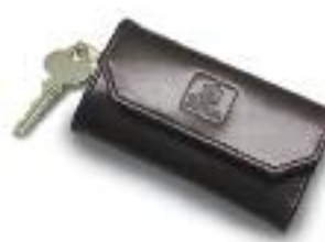
4 Ring Key Case LG 2507 Black Cordovan ▶ LG 2508 Color 8 Cordovan