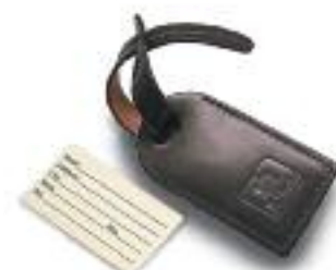
Briefcase Tag LG 1207 Black Cordovan ▶ LG 1208 Color 8 Cordovan