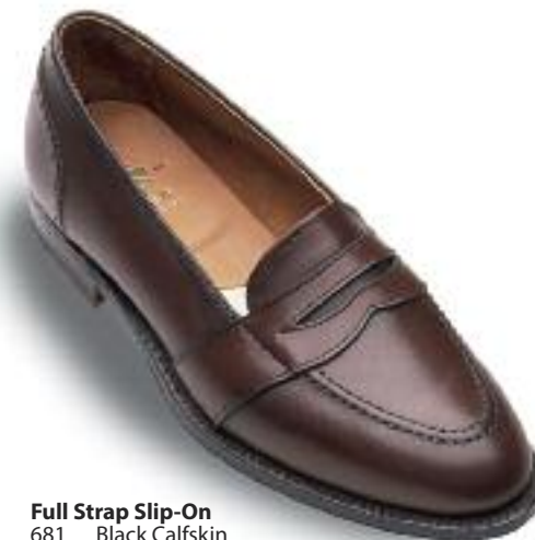
Full Strap Slip-On 681 Black Calfskin 683 Burgundy Calfskin 685 Burnished Tan Calfskin 684 Color 8 Cordovan (sizes on page 7) 6845 Black Cordovan (sizes on page 7) 686 Dark Brown Calfskin

Aberdeen Last Single oak leather outsoles