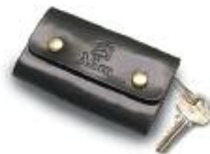
Key Case / 6 Ring LG 2407 Black Cordovan ▶ LG 2408 Color 8 Cordovan