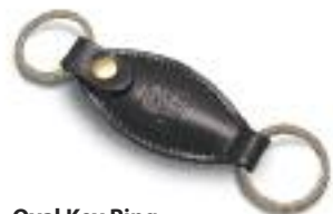
Oval Key Ring LG 2307 Black Cordovan ▶ LG 2308 Color 8 Cordovan