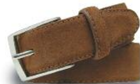
30mm Suede Dress Belt MB 5213 Tan Suede with Nickel Buckle MB 5214 Snuff Suede with Nickel Buckle MB 5215 Brown Suede with Nickel Buckle MB 5216 Navy Suede with Nickel Buckle

MB 0101 Black with Gold Buckle MB 0102 Burgundy with Gold Buckle MB 0103 Tan with Gold Buckle MB 0105 Dk. Brown with Gold Buckle