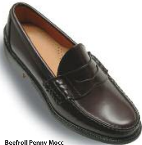
Beefroll Penny Mocc H410 Burgundy Polished Leather H414 Black Polished Leather