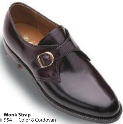
Monk Strap 954 Color 8 Cordovan

Aberdeen Last Single oak leather outsoles