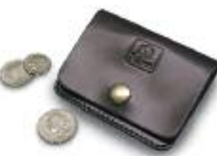
Coin Case LG 3307 Black Cordovan ▶ LG 3308 Color 8 Cordovan