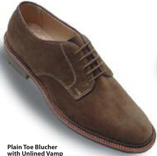
Plain Toe Blucher with Unlined Vamp ▶ 29331F Navy Suede 29332F Tan Suede ▶ 29336F Snuff Suede

Barrie Last Single flexible leather outsoles