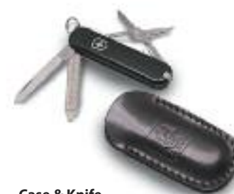
Case & Knife LG 3507 Black Cordovan ▶ LG 3508 Color 8 Cordovan