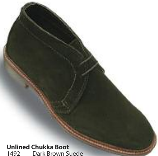
Unlined Chukka Boot ▶ 1492 Dark Brown Suede 1493 Snuff Suede 1494 Tan Suede 1497 Black Suede ▶ 14928 Hunting Green Suede

Leydon Last Single flexible leather outsoles