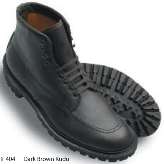
► 404 Dark Brown Kudu