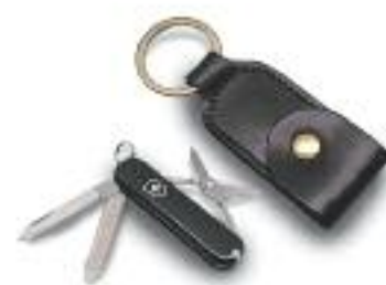
Knife Case / Key Ring LG 3607 Black Cordovan ▶ LG 3608 Color 8 Cordovan