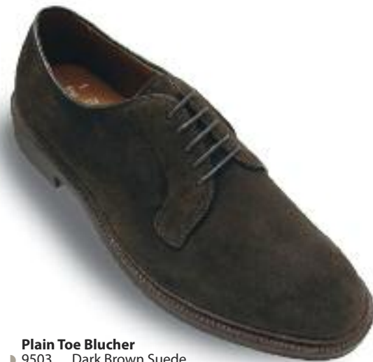
Plain Toe Blucher 9503 Dark Brown Suede

Barrie Last Double oiled leather outsoles