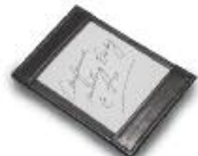
Note Holder & Cards LG 4207 Black Cordovan ▶ LG 4208 Color 8 Cordovan