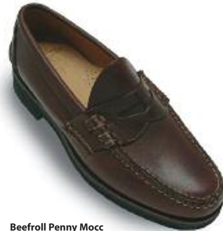
Beefroll Penny Mocc with Vibram® Soles H404 Black Aniline Pull-Up H406 Dark Brown Aniline Pull-Up

B 9 1/2-12, 13 D 6-12, 13, 14 E 6-12, 13 EEE 8-12, 13