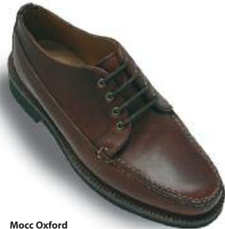
Mocc Oxford with Vibram® Soles H944 Black Aniline Pull-Up H946 Dark Brown Aniline Pull-Up

B 9 1/2-12, 13 D 6-12, 13, 14 E 6-12, 13 EEE 8-12, 13