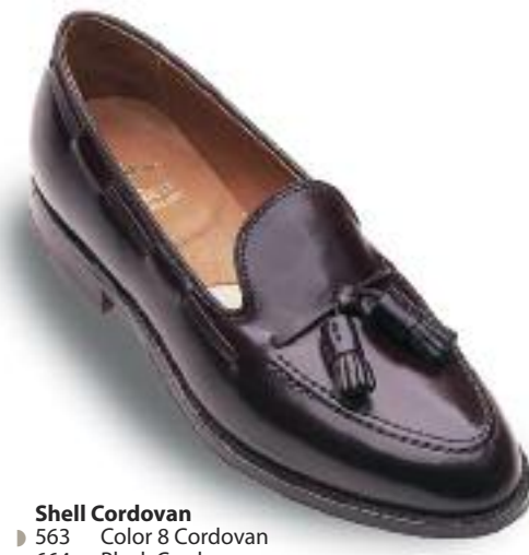
Shell Cordovan 563 Color 8 Cordovan 664 Black Cordovan

Aberdeen Last Single oak leather outsoles