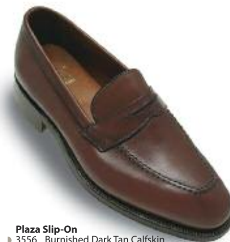
Plaza Slip-On 3556 Burnished Dark Tan Calfskin 3557 Black Calfskin