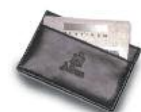
Mini Credit Card Case LG 4007 Black Cordovan ▶ LG 4008 Color 8 Cordovan