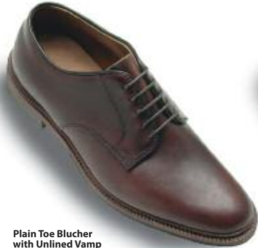
Plain Toe Blucher with Unlined Vamp ▶ 29364F Dark Brown Aniline Pull-Up

Barrie Last Single flexible leather outsoles