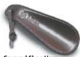
Covered Shoe Horn LG 5107 Black Cordovan ▶ LG 5108 Color 8 Cordovan