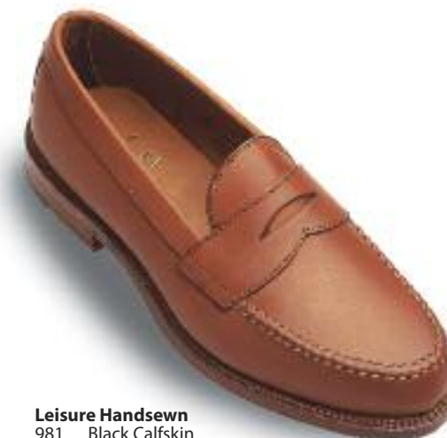
Leisure Handsewn 981 Black Calfskin 983 Burnished Tan Calfskin 984 Burgundy Calfskin 986 Color 8 Cordovan 987 Black Cordovan