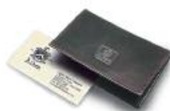
Folding Business Card Case LG 4107 Black Cordovan ▶ LG 4108 Color 8 Cordovan