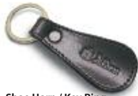
Shoe Horn / Key Ring LG 3807 Black Cordovan ▶ LG 3808 Color 8 Cordovan