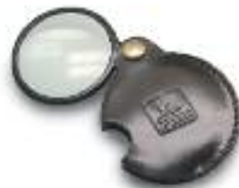
Magnifier Case LG 3007 Black Cordovan ▶ LG 3008 Color 8 Cordovan