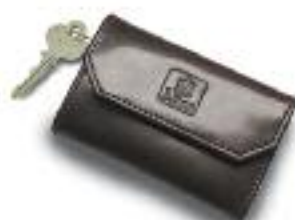
6 Ring Key Case LG 2607 Black Cordovan ▶ LG 2608 Color 8 Cordovan