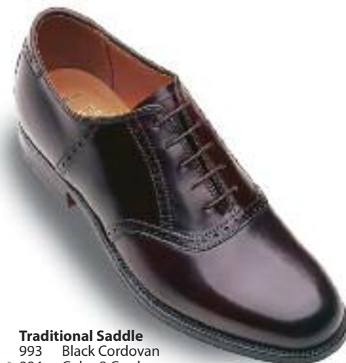
Traditional Saddle 993 Black Cordovan 994 Color 8 Cordovan