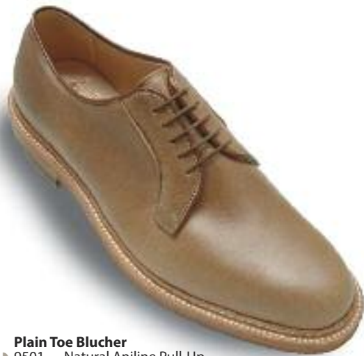
Plain Toe Blucher 9501 Natural Aniline Pull-Up

Barrie Last Double oiled leather outsoles