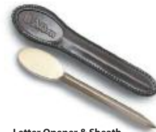
Letter Opener & Sheath LG 5207 Black Cordovan ▶ LG 5208 Color 8 Cordovan