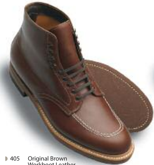
► 405 Original Brown Workboot Leather