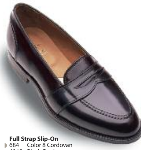
Full Strap Slip-On 684 Color 8 Cordovan 6845 Black Cordovan

Aberdeen Last Single oak leather outsoles