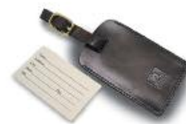
Luggage Tag LG 1407 Black Cordovan ▶ LG 1408 Color 8 Cordovan