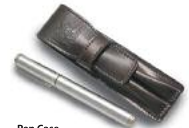
Pen Case LG 3707 Black Cordovan ▶ LG 3708 Color 8 Cordovan