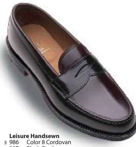
Leisure Handsewn 986 Color 8 Cordovan 987 Black Cordovan